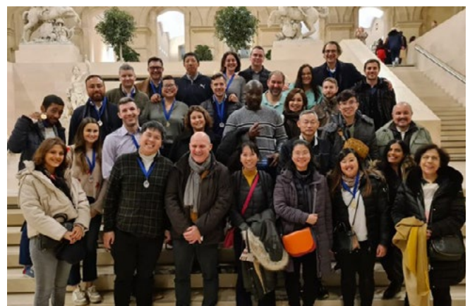
Team building at Le Louvre Museum for Touax Container