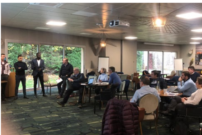
Touax Rail seminar: "What is not measured cannot be improved"

The end of the year is always the time to wrap up the current year and plan the next one without forgetting enhancing team spirit. Both Touax Rail and Touax Container worked intensively and had fun for their international yearly seminars.