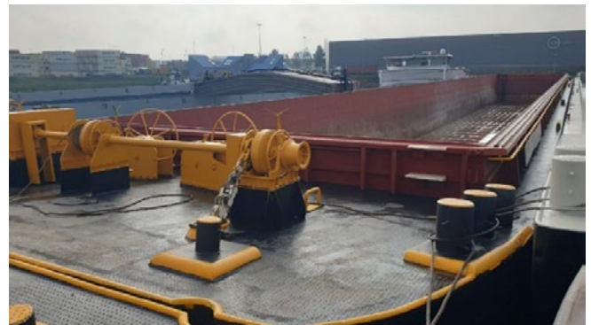
River Barge ready for loading