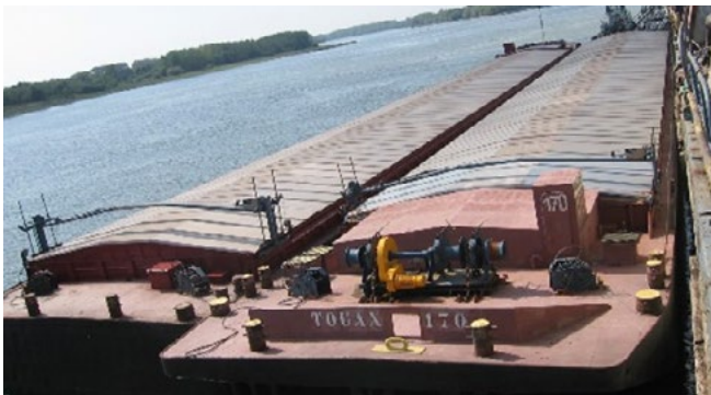
Two second hand dry bulk river barges

This generated a strong interest among agriculture’s companies for the river transportation and Touax River Barges is working with one of their association to switch from traditional road transport to much greener barges. The new vessels will start to operate in 2025.