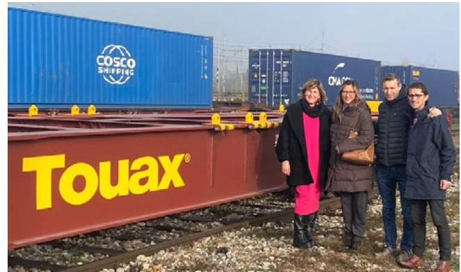
Touax Rail team in Italy receiving the 1 st set of 6 axle wagons Sggmrss 90'

Beside our development in Europe, we have successfully ordered 2 additional rakes (complete trains) in India for our existing customers and expect to continue to grow steadily with another 5 rakes in the coming months.